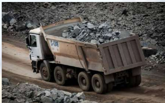
A truck carries Vanadium ore.

Geological Survey of India (GSI) has found promising concentration of vanadium in the palaeo-proterozoic carbonaceous phyllite rocks in the Depo and Tamang