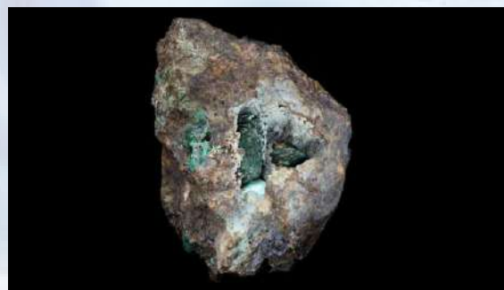
Trustees of The Natural History Museum, London