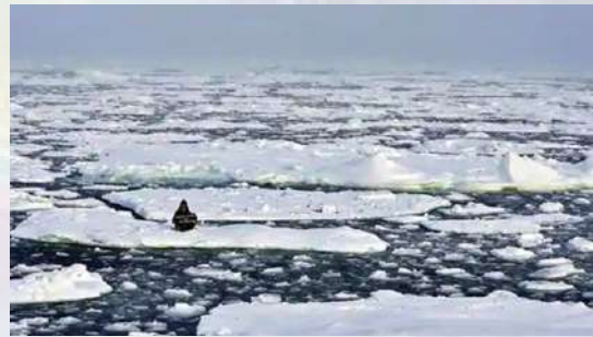
Activist Mya-Rose Craig, 18, sits on an ice floe in the middle of Arctic Ocean demanding action on climate crisis.

Earth's ice is melting faster today than in the mid-1990s, according to new research that shows the loss is now following the worst-case scenarios for climate change, which has nudged global temperatures ever higher.